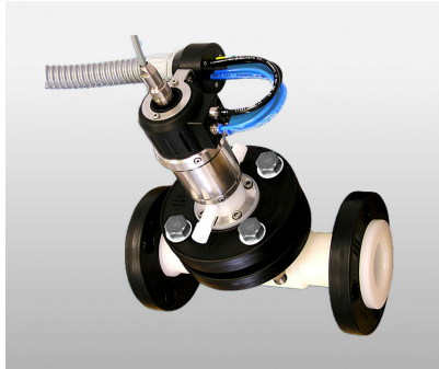
Installation on EXtract 820 with flow vessel EXflow720