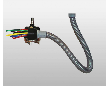
Simple connection of all control tubes with EXconnect 150