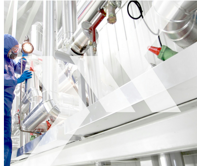
Usable for industrial applications